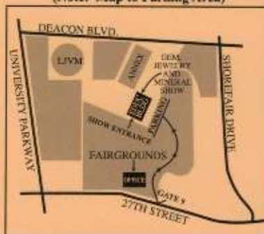
Educational Building, The Fairgrounds For Free Parking Enter Gate 9 (Follow Signs)

Children thru Grades 12: Free with accompanying adult